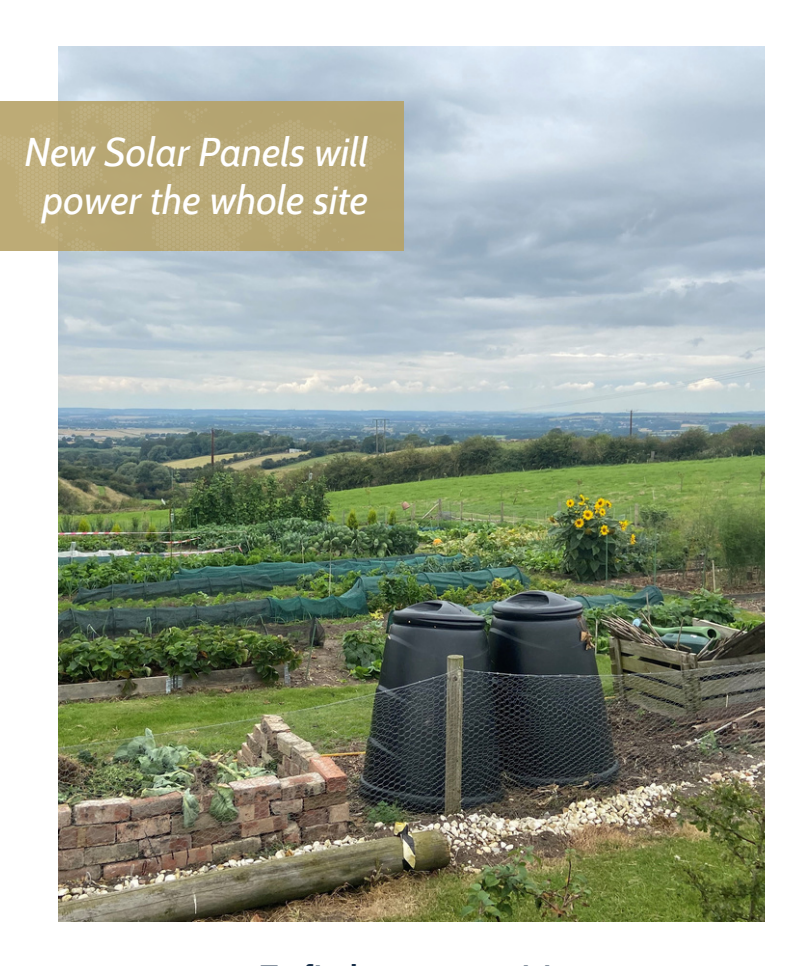
To find out more, visit: www.rockfoundation.org.uk

For information on community grants, visit: www.west-lindsey.gov.uk/communities-safety/grants-funding/community-action-fund